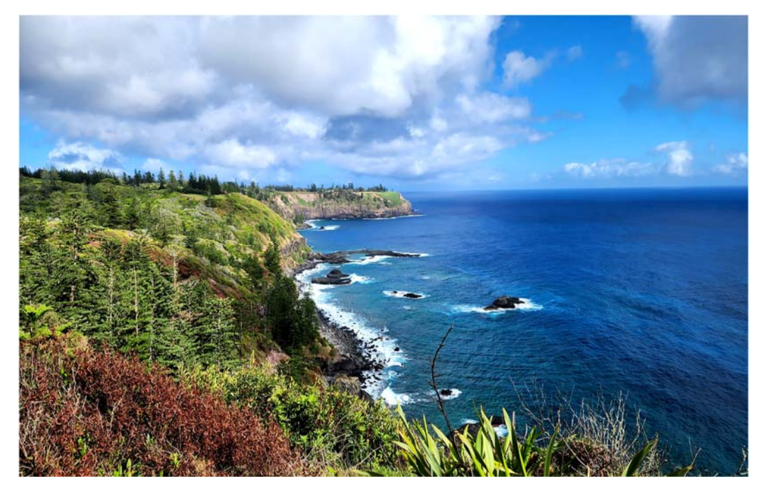
Day 7 Saturday 5 April 2025